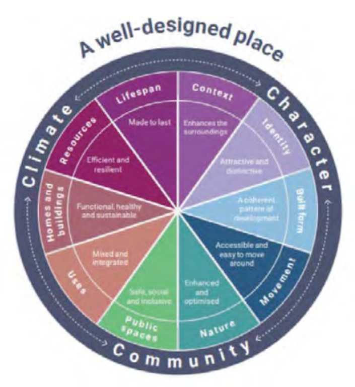
Figure 3: The ten characteristics of well-designed places (National Design Guide)

3.311.3.312. Masterplans are an important tool used by designers to set out the strategy for a new development and to demonstrate that the general layout, scale and other aspects of the design are based on good urban design principles. The Cherwell Residential Design Guide SPD sets out the principles of good design that must be demonstrated through the preparation of a masterplan as part of applications for major development and development of allocated sites. These, and other masterplans, should be produced in partnership with Cherwell District Council, the community and other stakeholders. For smaller developments, proposals need only be supported by a design and access statement which should provide a detailed design assessment proportionate to the scheme proposed.