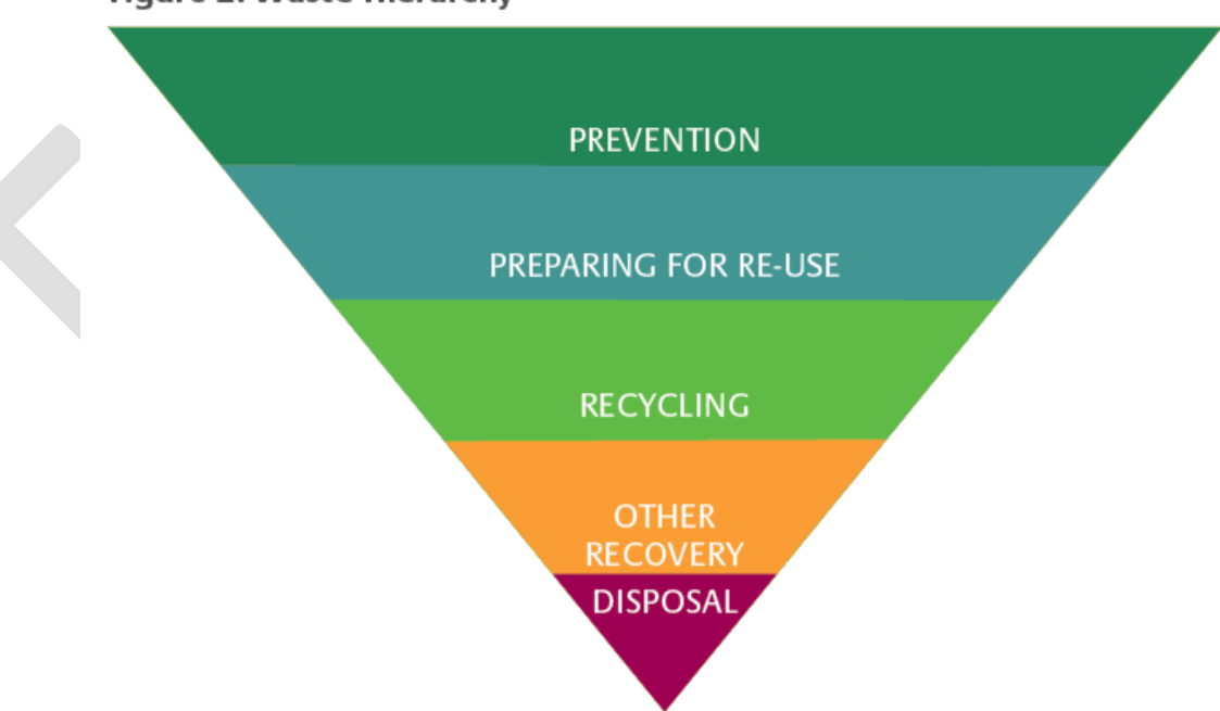
Figure 2: Waste Hierarchy

3.122.3.123. To minimise waste and pollution, and to reduce the impact of waste on climate change, we expect future developments to support the application of the waste hierarchy (Figure 2).