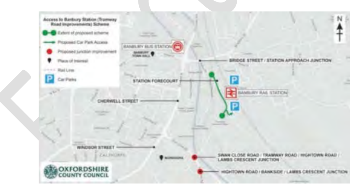
Banbury Tramway Road Improvements