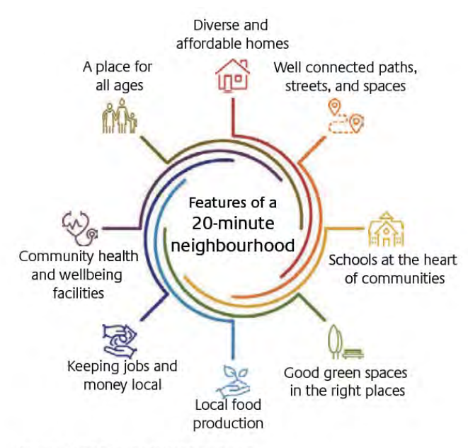
Figure 4: 20 Minute Neighbourhoods